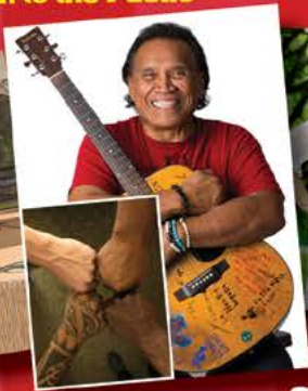
Henry Kapono & Duke's on Sunday Band